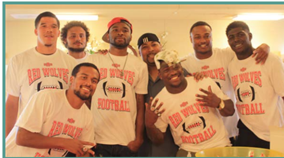
ASU Red Wolves Football Team!